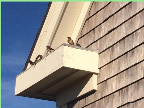
Barn Swallow

Using scrap wood, coconut husk from a planter, diatomaceous earth and a kitchen sifter, she constructed a makeshift nest, sprinkling the new husk nest with the diatomaceous earth. Then she quickly took the infested nest down and transferred the babies into the new nest after sprinkling each of them. This was all done as quickly as possible as there was a good chance the parents might not return if it took too long.