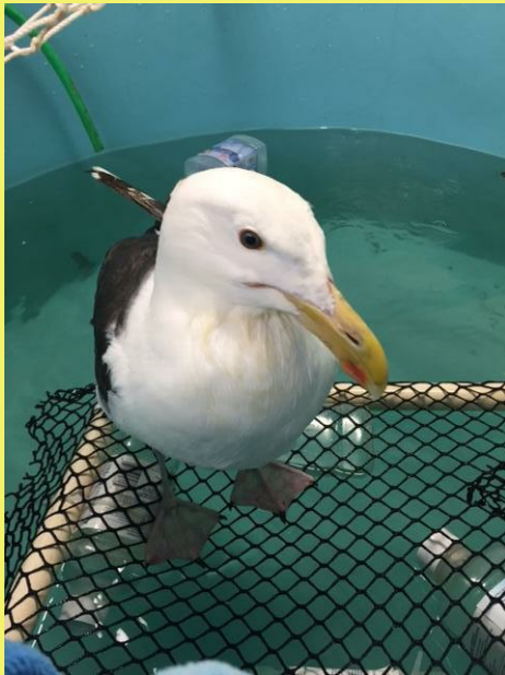
Spa time in our Seabird Therapy Pool.

She was thrilled to see the once "pitiful" patient from a couple of weeks before, fly off as the strong and gorgeous waterbird he was meant to be!