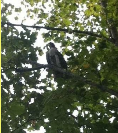
Red-tailed Hawk - Released!

receive a hawk found on a road we also know it might have been hit by a car while it was hunting.