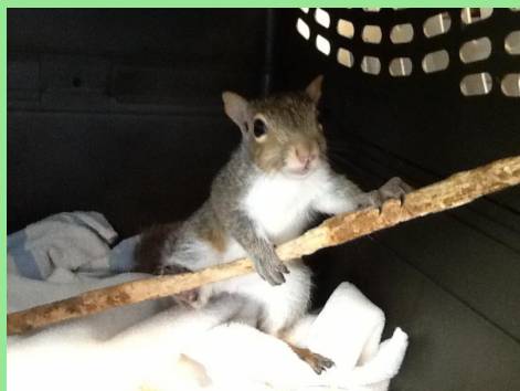
"Stay away from my nuts!" One of the three squirrels defending his nut cache.