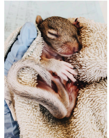
The first orphaned E Gray Squirrels of the season.