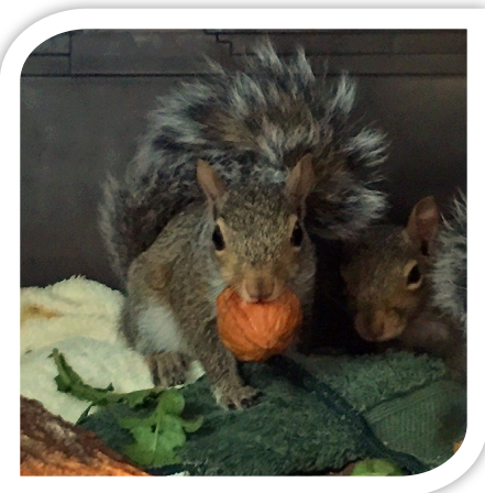
Eastern Gray Squirrels

Wild Care does not receive state, federal, or municipal funding. We rely heavily on donations from the general public and private donors to keep our hospital running. Wild Care currently receives up to 1,200 animals per year from caring citizens like you. Due to an influx of animals this past summer, we have already provided care to over 1,300 animals this year. The closure of the Cape Wildlife Center will bring even more animals to our doorstep.