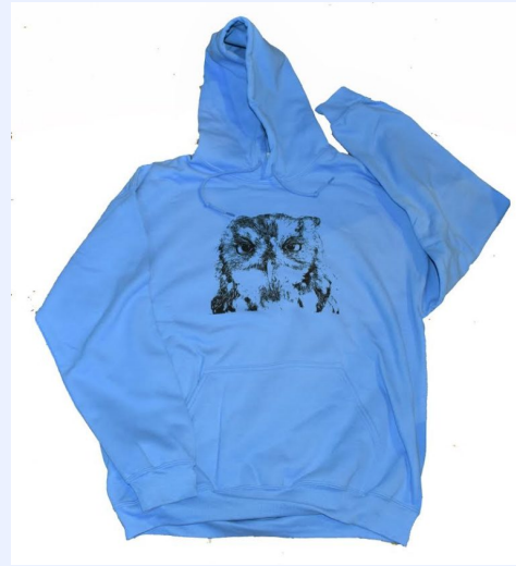
Owl - Powder Blue Hoodie ($45)