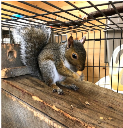
Eastern Gray Squirrel eating an acorn.