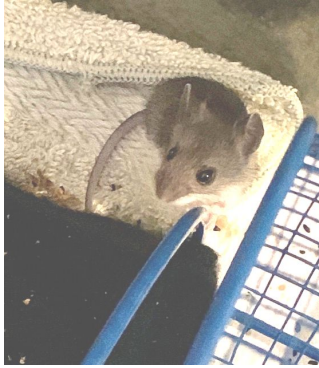
Juvenile White-footed Mouse.