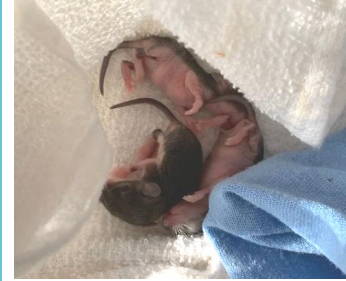
White-footed Mouse pups.