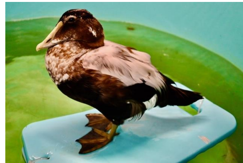
Common Eider. Photo By Kerry Reid