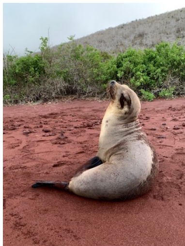
Photo Above: “Jackie’s Room”. Photo Left: Galapagos Sea Lion, Rabida Island

-In October, I had the great fortune to take a group of people to the Galapagos Islands with Linblad and National Geographic. This trip was a fundraiser for Wild Care and raised $5,600. I firmly believe that viewing wildlife locally and globally, helps us to further appreciate wildlife and recognize their value, and better advocate for them. Our next fundraising trip is to see wildlife in Scotland 2022. (See page 2.)