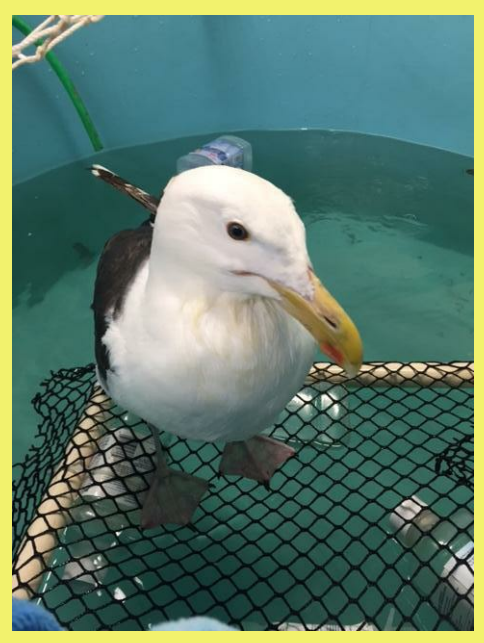
Spa time in our Seabird Therapy Pool.

She was thrilled to see the once "pitiful" patient from a couple of weeks before, fly off as the strong and gorgeous waterbird he was meant to be!