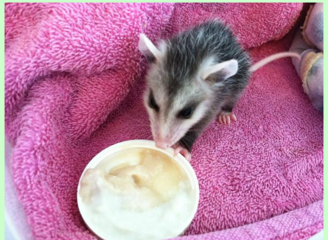
Virginia Opossum.