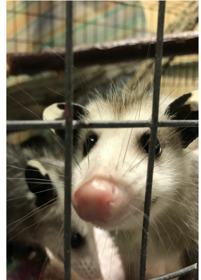
Virginia Opossum orphans.

On our exam table, a Northern Gannet is given life-sustaining hydration fluids; and a new arrival, a cold, wet mouse removed from a glue trap, is placed in a small container on a heating pad so it can dry off and recover. Everywhere you look, animals are receiving individual and specialized care. From the largest bird like a gannet, to the smallest mouse, we provide care because every animal matters . Every individual plays an important role in the ecology of Cape Cod, and we believe it is our responsibility to help wildlife in need.