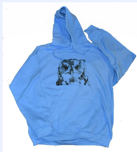
Owl - Powder Blue Hoodie ($45)