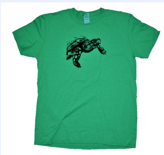
Turtle T-shirt ($20)