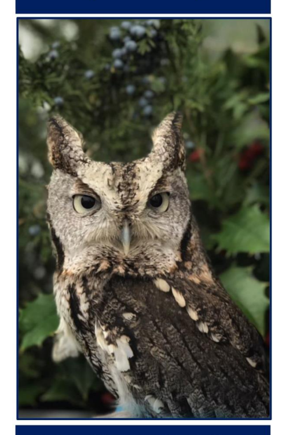
Living with our "Wild Neighbors"