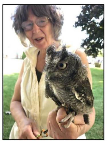
Up Up, the Eastern Screech Owl