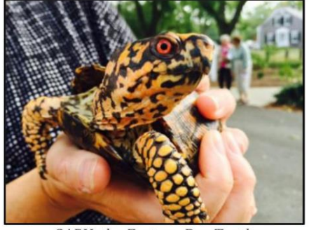
GARV, the Eastern Box Turtle