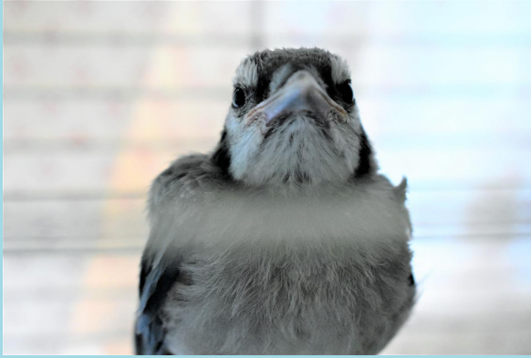
Blue Jay nestling