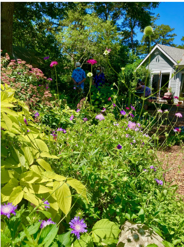
A peek into Pamela's backyard gardens!