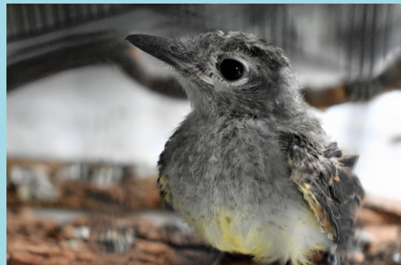
Blue-headed Vireo nestling.