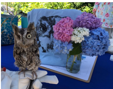
Nickerson Staying cool at the WC table at Hydrangea Fest 2020

Please consider making a Donation today, We need you as much as you need us!