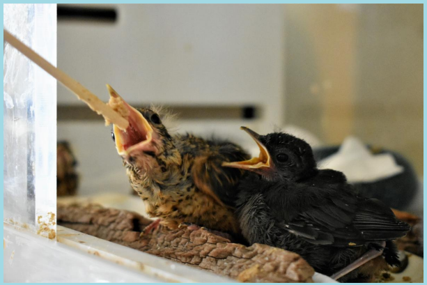
American Robin & Gray Catbird nestlings