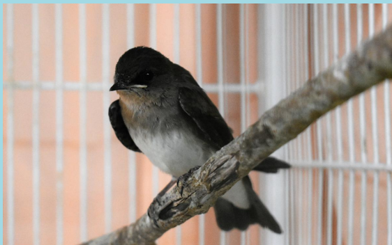
Fledgling Northern Rough-winged Swallow