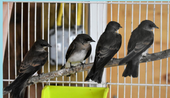
Northern Rough-winged Swallow fledglings

Check our Facebook page where we continue to post updates and uplifting stories!