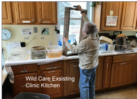
Wild Care Existing Clinic Kitchen

The new Cleanliness Room will provide a well-functioning designated room to sanitize and disinfect linens, dishes, and animal enclosures. The existing Clinic Kitchen will then function for patient food prep only.